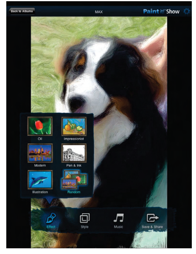
Illustration: Applies a wide variety of brushstrokes to produce an illustration-style painting.

The app randomly selects among the painting effects or choose from five options