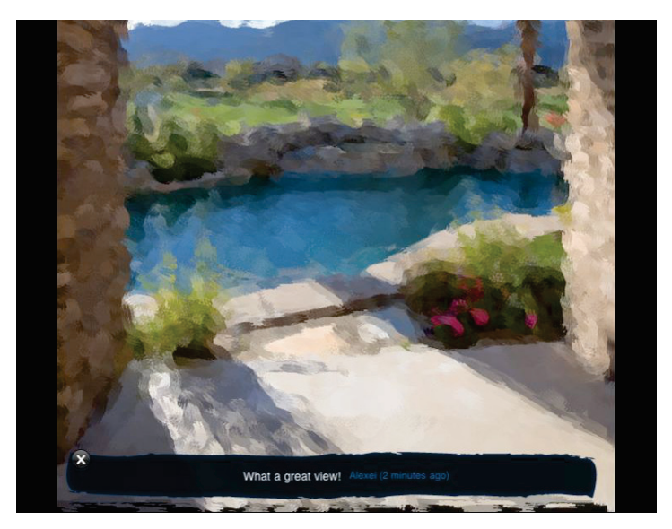
Corel Paint it! Show can display comments from Facebook photos

What's more, you can set up your slideshows to include or hide any comments associated with photos that you have pulled in from Facebook.