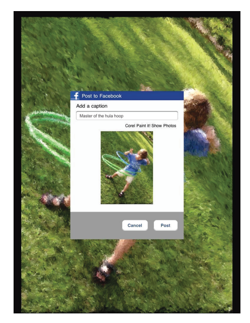
Post paintings to Facebook with captions

Note: You can tap the Forward button to skip ahead to paint the next photo.